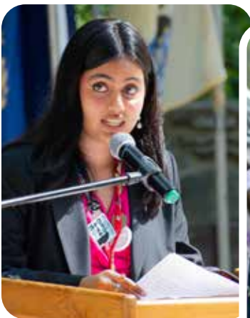
Debating policy with respect for each other