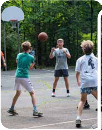
Competing as a team on the court