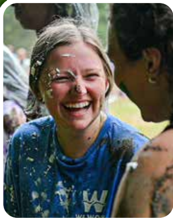
Getting covered in ketchup and whipped cream