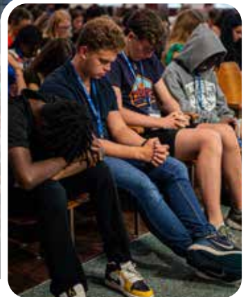
Leading your friends in prayer