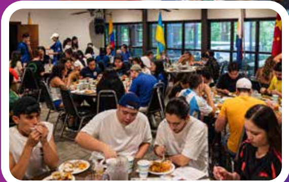
On International Night, our staff share food from their part of the world.