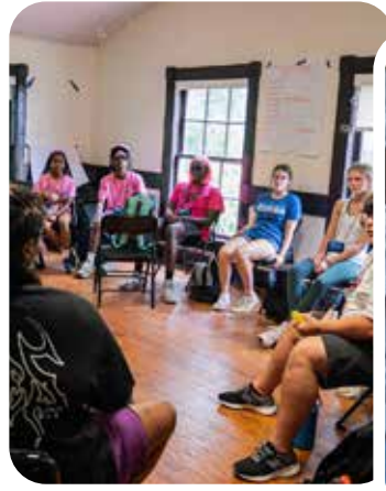
Preparing for life after high school