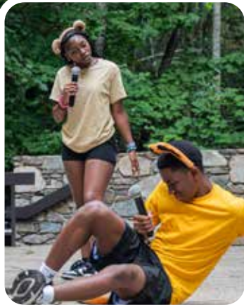
Planning and performing a morning devotion