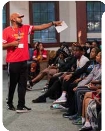
Passing down knowledge to the next generation