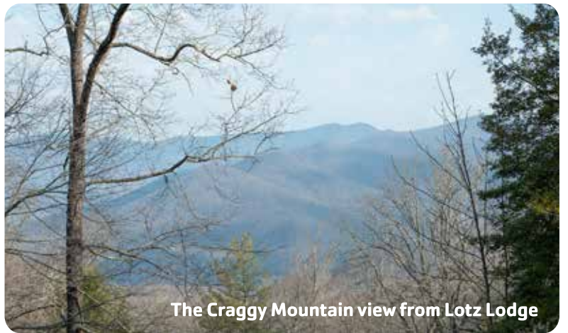
The Craggy Mountain view from Lotz Lodge

“I am so grateful ... to be standing here today, and to watch God do an amazing work, AGAIN, in a different way, A NEW WAY, on this Mountain.”