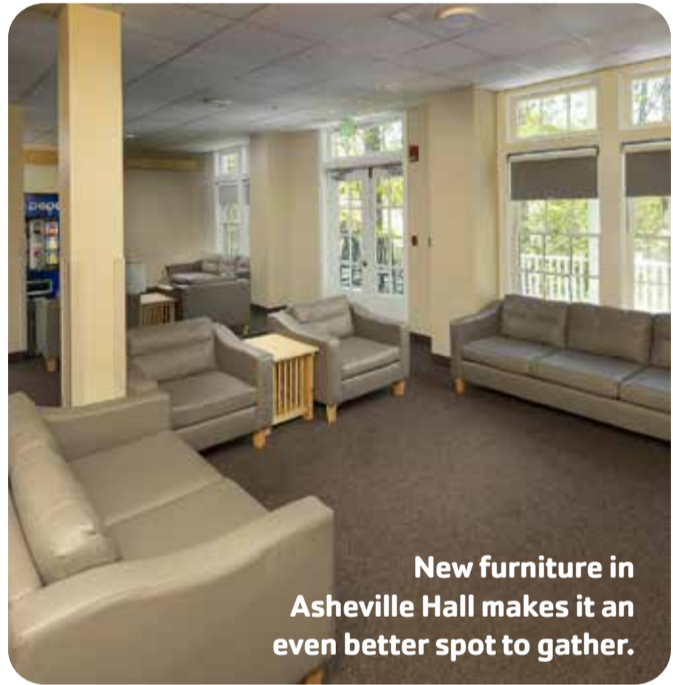
New furniture in Asheville Hall makes it an even better spot to gather.