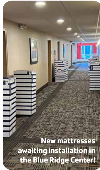
New mattresses awaiting installation in the Blue Ridge Center!

As you navigate the rest of our campus, you will notice little touches that make a big difference – among these are the new furniture in Asheville Hall's lobby, new mattresses in rooms throughout several of our buildings, seasonal flowers blooming around the Mountain, podiums and water stations to serve our guests' needs as well as a brand new archery range that has already challenged young people to try something new.